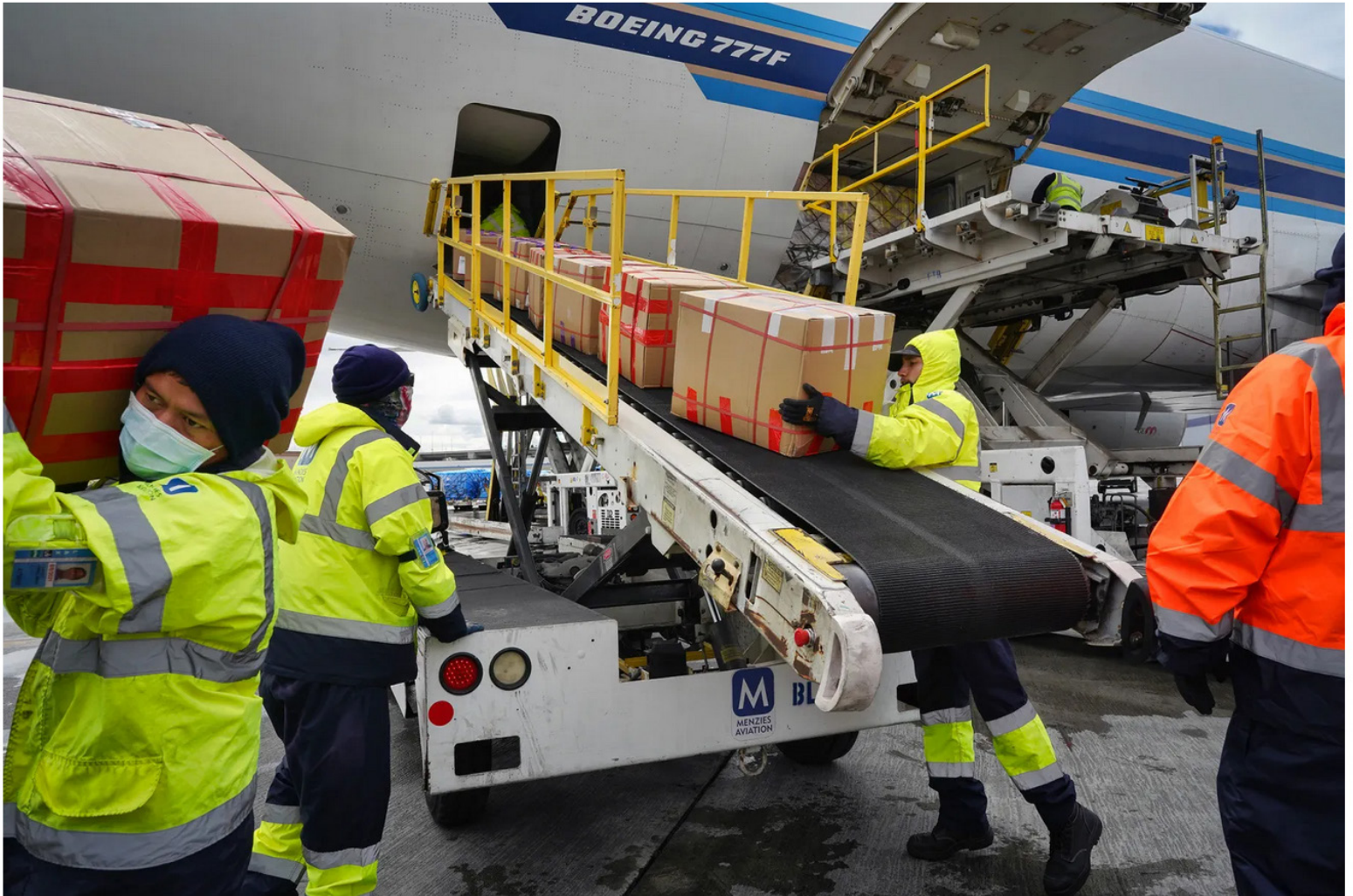
Ground crew at the Los Angeles International airport unload cargo from a plane upon its arrival on April 10, 2020.

California has a proud history of aggressively confronting and tackling the most critical environmental issues of our time while still prioritizing the needs of working people. We've taken meaningful steps to make cars burn cleaner gasoline and reduce the smog that harms our communities, yet the aviation industry remains practically unchanged.